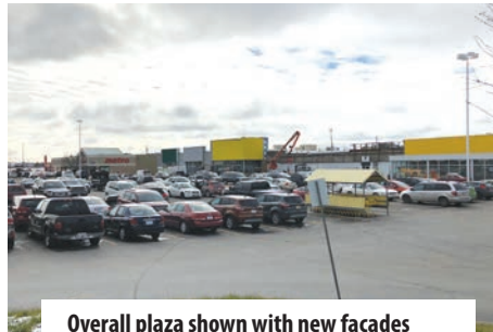
Overall plaza shown with new facades nearly complete