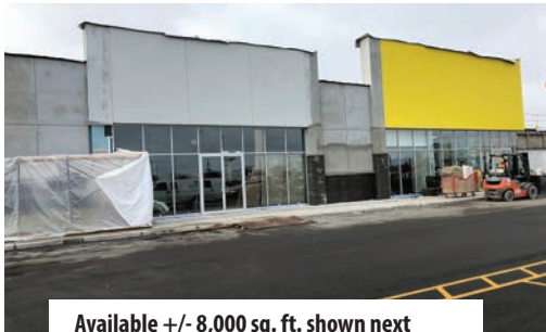
Available +/- 8,000 sq. ft. shown next to new Planet Fitness

Available Unit: $15.00 PSF Net New Pad: $38.00 PSF Net Additional Rent: $5.00 PSF (Estimated)