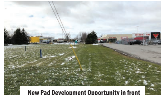
New Pad Development Opportunity in front of No Frills and Canadian Tire